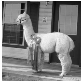
Sire: Maple Brook Barnabus

COLOR CHAMPION – 2013 MOPACA SHOW – JUVENILE CHAMPION BRED & OWNED – 2014 AMERICAN ALPACA SHOWCASE CHAMPION BRED & OWNED - 2015 GWAS COLOR CHAMPION – 2015 AMERICAN ALPACA SHOWCASE COLOR CHAMPION – FLEECE AND HALTER – 2015 FALL FEST COLOR CHAMPION – 2015 A-OK BLAST OFF B&O CHAMPION – 2016 MOPACA SHOW